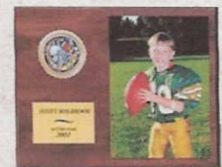
PLAQUES GREAT SPONSOR GIFTS (CALL FOR PRICING AND TO ORDER)