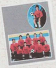
MEMORY MATE (PLAIN GRAY OR BLACK CARDBOARD WITH REMOVABLE PICTURES)