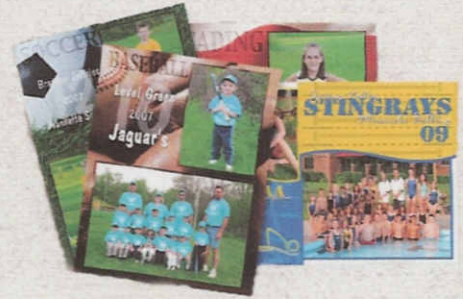
SPORTS COMPOSITE (PERSONALIZED TO TEAM, ATHLETE, AND SPORT) (8X10 SIZE)