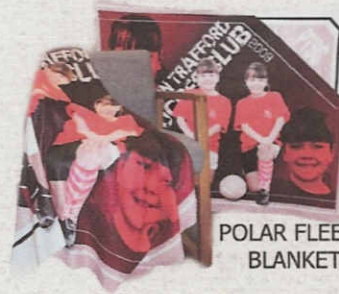
POLAR FLEECE BLANKET