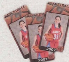
KEY TAGS (SET OF 3)