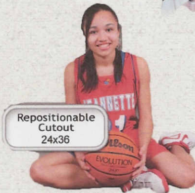
Repositionable Cutout 24x36